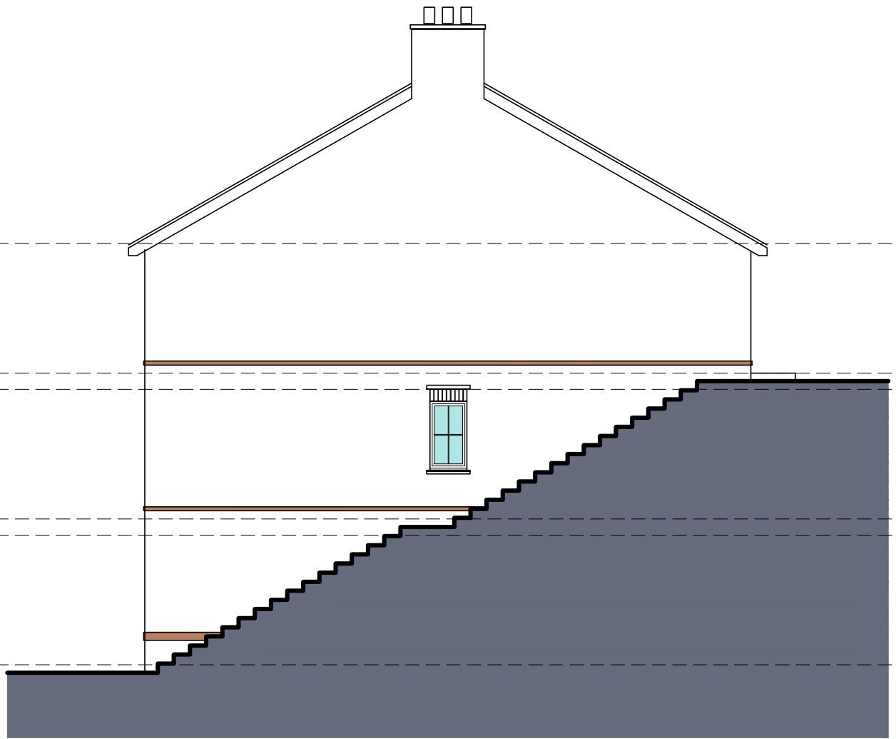
SIDE ELEVATION 1